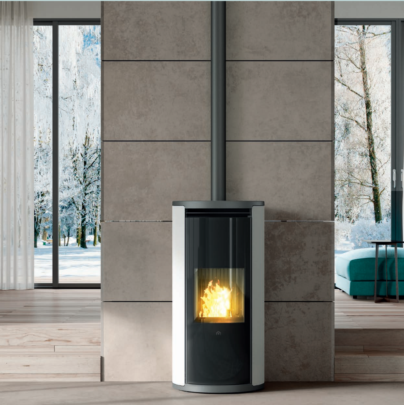
Acero blanco mate Aço branco mate Ατσάλι λευκό ματ Opaque white steel